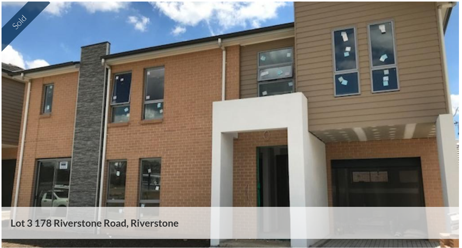
Lot 3 178 Riverstone Road, Riverstone